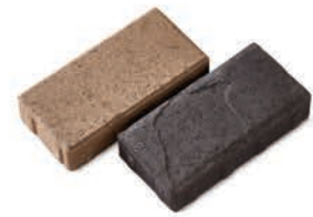
Chroma Color Protected